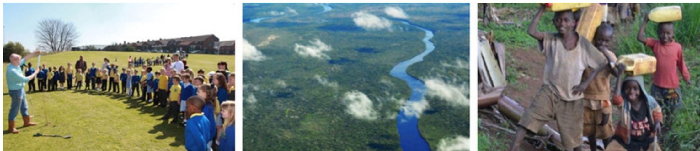
Sample Carbon Offsetting Projects - UK Schools Tree Planting - Amazon Avoided Deforestation, Brazil - Clean Water projects, Rwanda

The offsetting process is simple and straightforward - just visit www.carbonfootprint.com/carbonoffset.html and type in your CO 2 tonnage (from the front page of this report) and this will show you the latest range of projects and their pricings. Certification is available to download online.